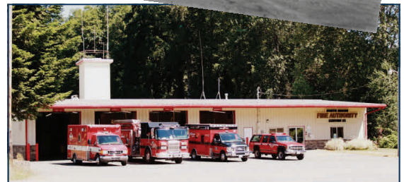
Then and Now...