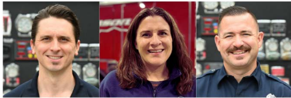
North Mason Regional Fire Authority Mobile Integrated Health & Resource Access Team